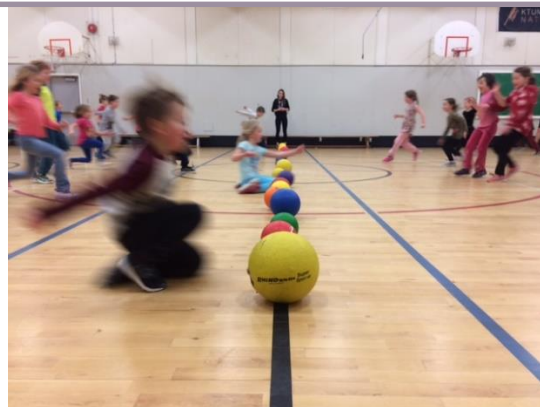
Primary Games is back on Wednesday at lunch, led by COTR students.