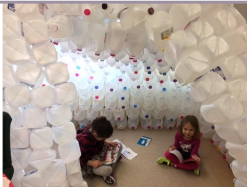
Mrs. Morrison's K/1 class created a reading igloo out of 4L milk jugs (thanks in large part to Starbucks)